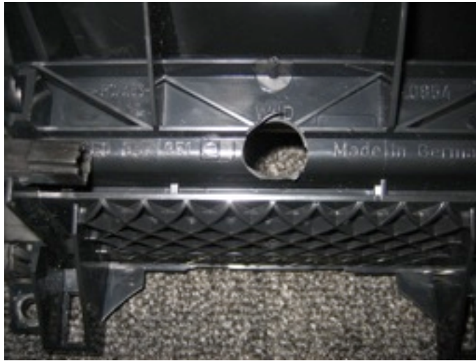
Hole location here for B6