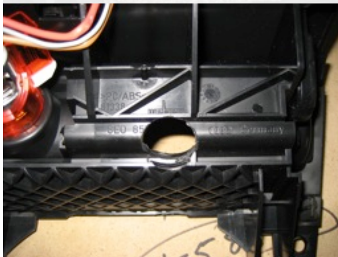
Hole location here for B7

In the spot indicated, drill a 3/4" hole for the spec.dock's wiring to pass through the ashtray carrier.